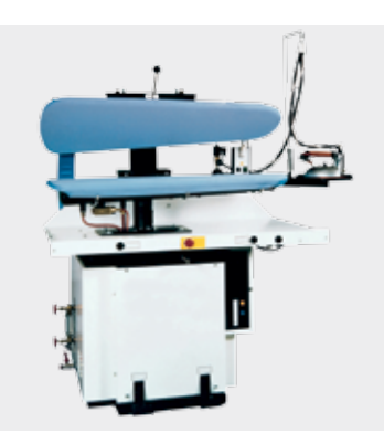
FPA1-D Automatic Cleaning Press with universal shape