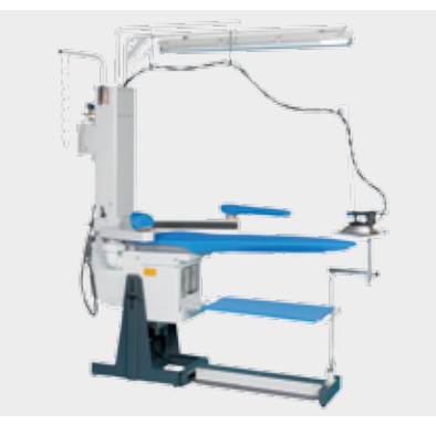
FIT1-WC Vaccum/Blowing Table (left ended) without boiler