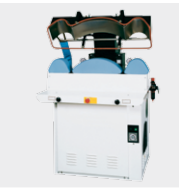
FPA6-WC Collar and Cuff Press