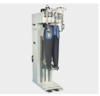
FTT2 Trouser Topper