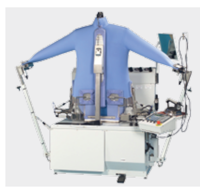
FSF2 Blowing Shirt Finisher FSF3 Pressing Shirt Finisher