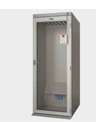
FC48 Finishing Cabinet 8 hangers