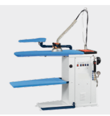
FIT2B Vacuum Ironing Table with integrated automatic boiler