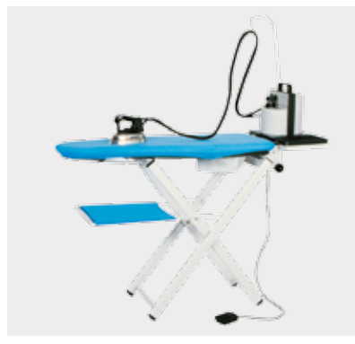
FIT1 Folding Table with manual boiler (2 hours) + iron