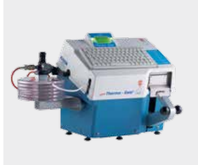
Y150 Marking Machine