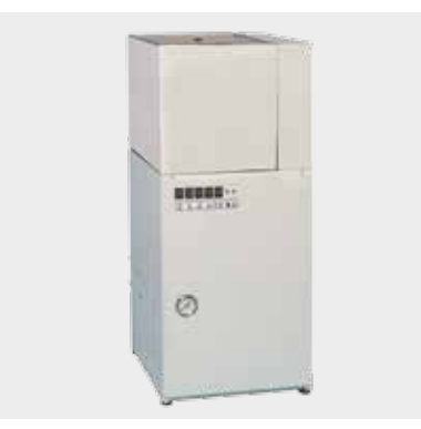
FSB24C Boiler 24 kW with condensate collecting tank