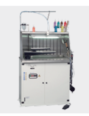
FSU4 Pre-Spotting and Pre-Brushing Cabinet with vaccum