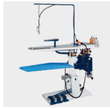
FSU3 Pre-Spotting Portable Table