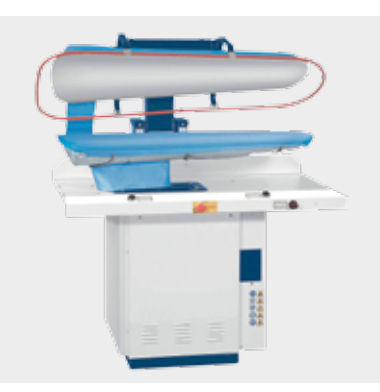
FPA1-WC Automatic Laundry Press with universal shape

FPA3-WC Automatic Laundry Mushroom Press